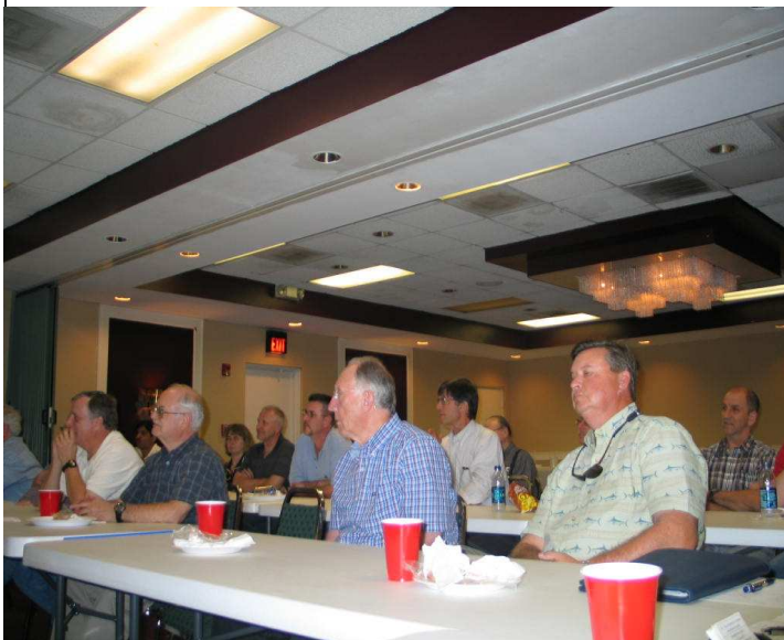
Intense concentration for Instrumentation Grounding seminar